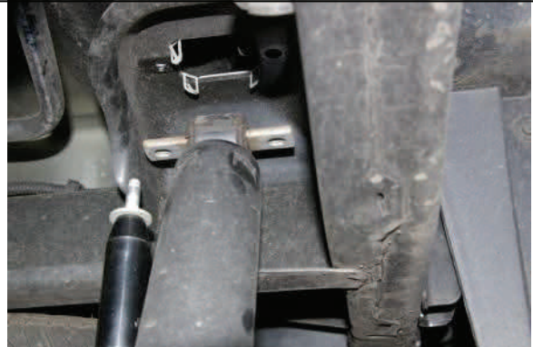
Disconnect upper shock mounting bolts