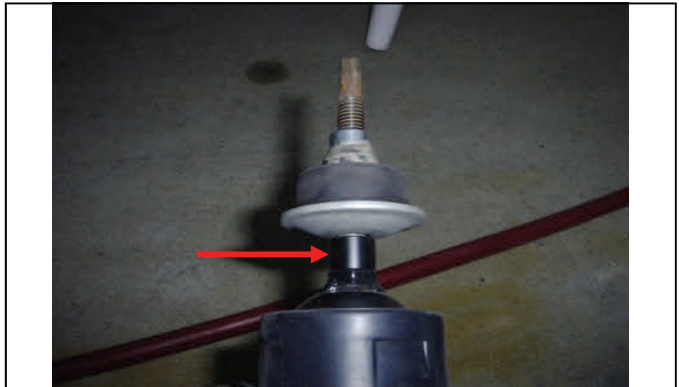
Install spacer underneath bottom shock bushings