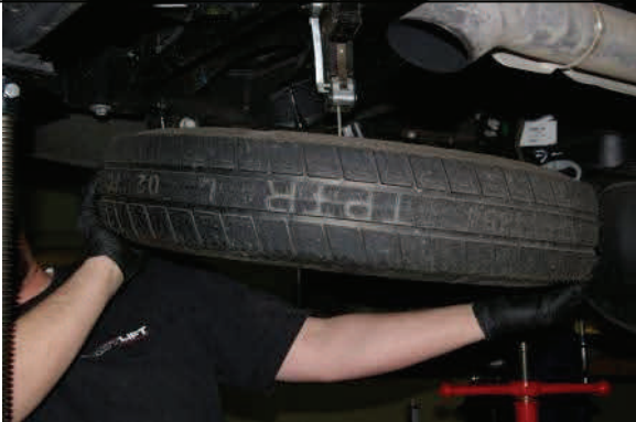
Remove spare tire in order to remove shackle bolts