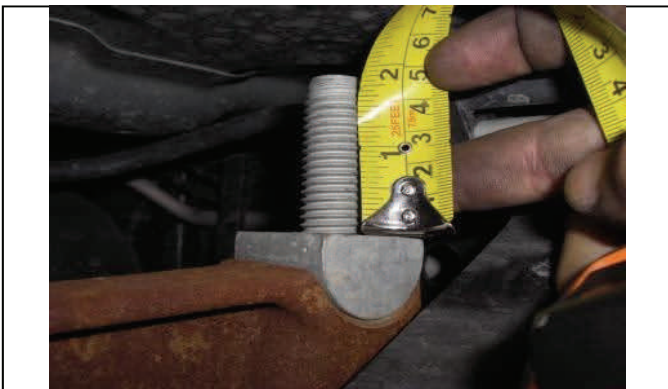
Measure threads on top of torsion bar adjusting block