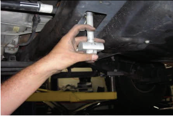
Reinstall adjustment bolt and block to original measurements

Note: Torsion bars can be adjusted to the initial thread measurements on the adjusting bolts. Once the rear parts are installed and with the vehicle on the ground the necessary adjustments can be made and finalized by the alignment shop.