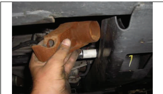
Remove OE torsion key