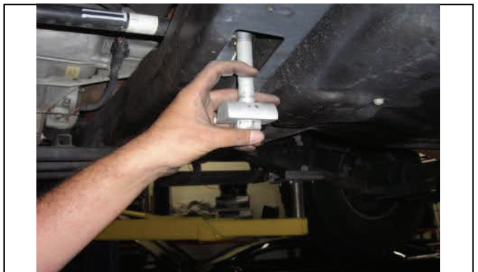
Then remove torsion bar adjusting block and bolt