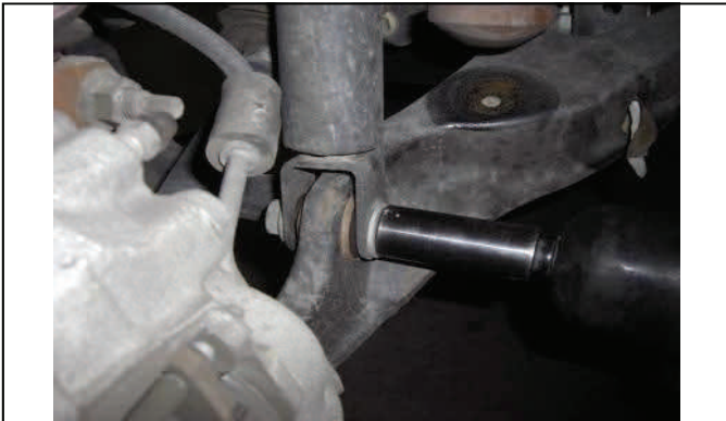
Remove lower shock mounting bolt/nut