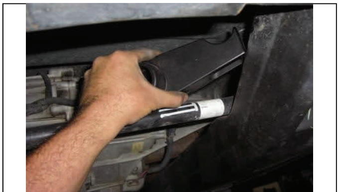
Install new ReadyLIFT forged torsion key