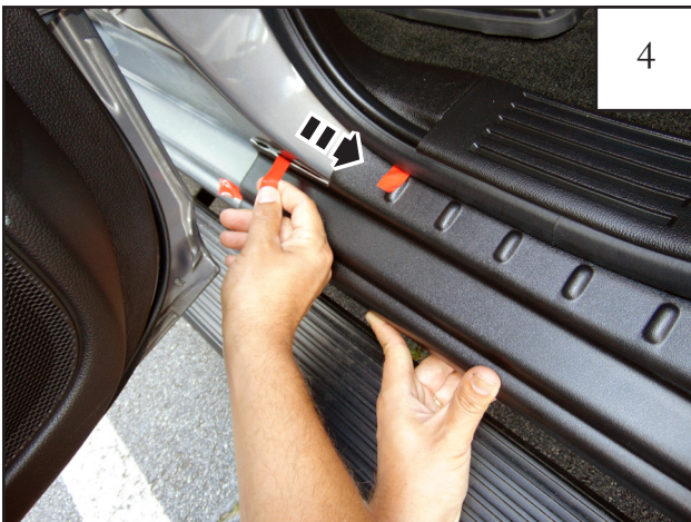
Pull tape liner tab 1.

Place part on vehicle, making sure to line up edges of part with edges of vehicle. Ensure that all tape tabs are accessible. Firmly press on exposed areas of tape to tack Trail Armor in place. NOTE: Refer to step 1 for placement of certain tabs.