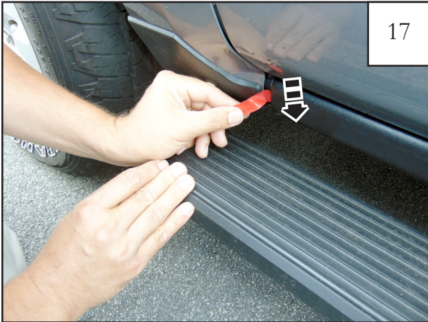
Pull tape liner tab 5. NOTE: It may be necessary to partially close door in order to access tab.