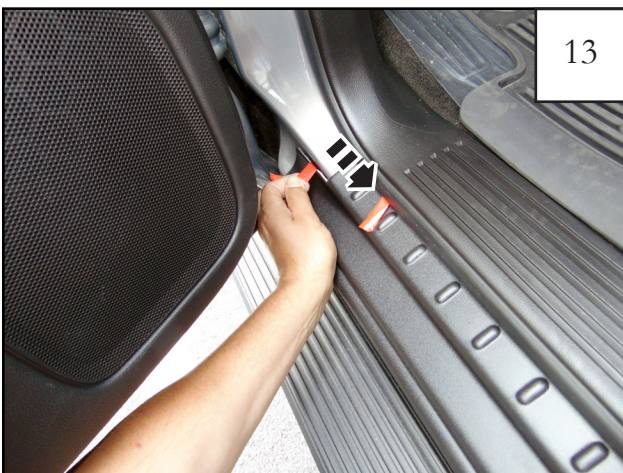
Pull tape liner tab 1.

Place part on vehicle, making sure to line up edges of part with edges of vehicle. Ensure that all tape tabs are accessible. Firmly press on exposed areas of tape to tack Trail Armor in place. NOTE: Refer to step 10 for placement of certain tabs.