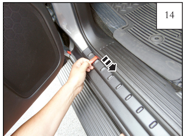
Pull tape liner tab 2.