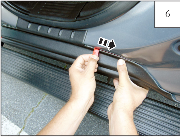
Pull tape liner tab 3.