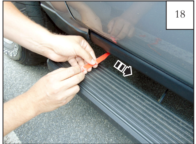
Pull tape liner tab 6. NOTE: It may be necessary to partially close door in order to access tab.