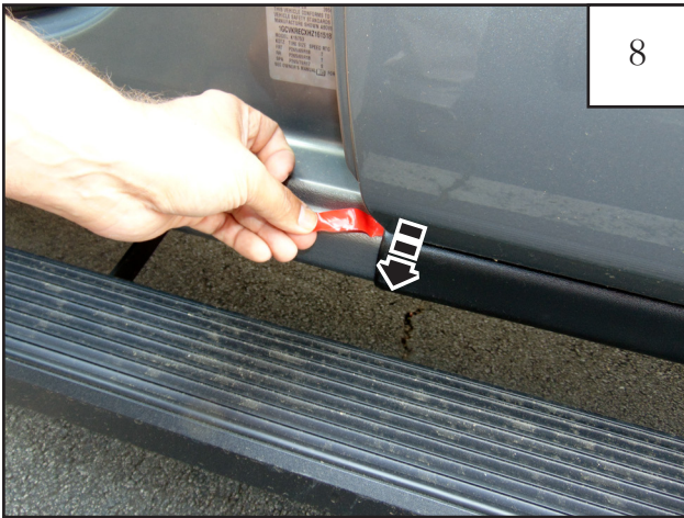
Pull tape liner tab 5. NOTE: It may be necessary to partially close door in order to access tab.