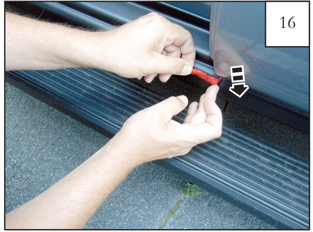
Pull tape liner tab 4.