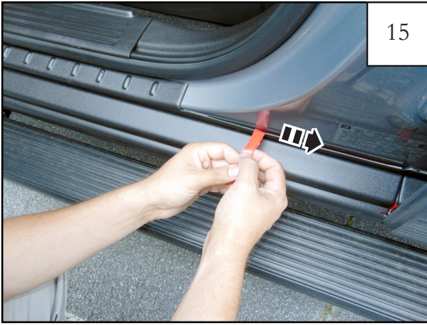
Pull tape liner tab 3.