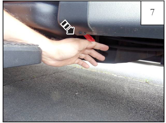
Pull tape liner tab 4.