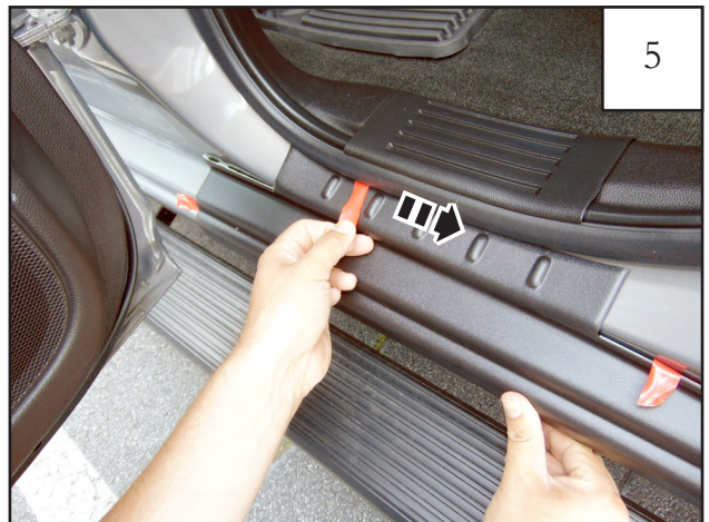
Pull tape liner tab 2.