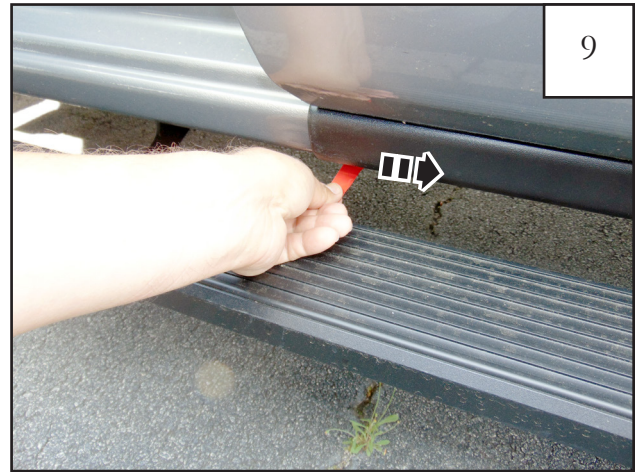
Pull tape liner tab 6. NOTE: It may be necessary to partially close door in order to access tab.