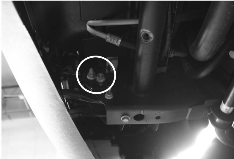
Figure 3 - STUD PLATE NUT LOCATION