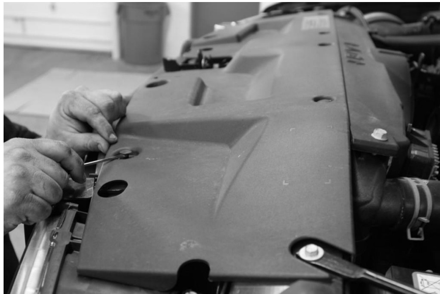
Figure 1 - CLIP REMOVAL