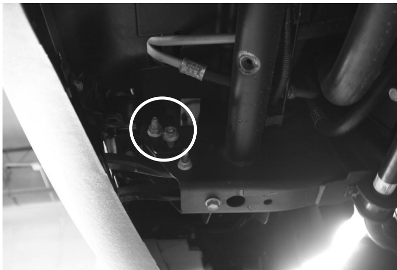
Figure 3 - STUD PLATE NUT LOCATION