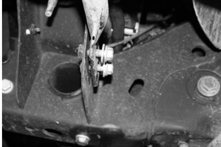
Figure 2 – Outer Bumper Support Screws