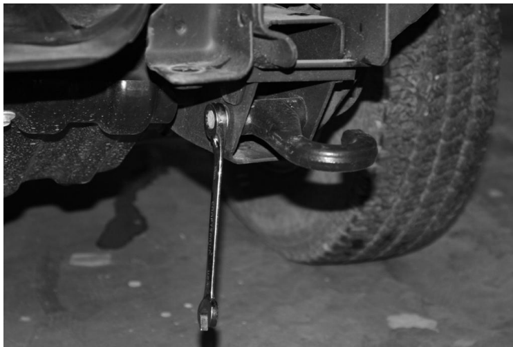
Figure 4 - TOW HOOK