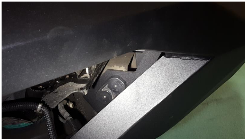
Figure 7 – Stud Plate Orientation