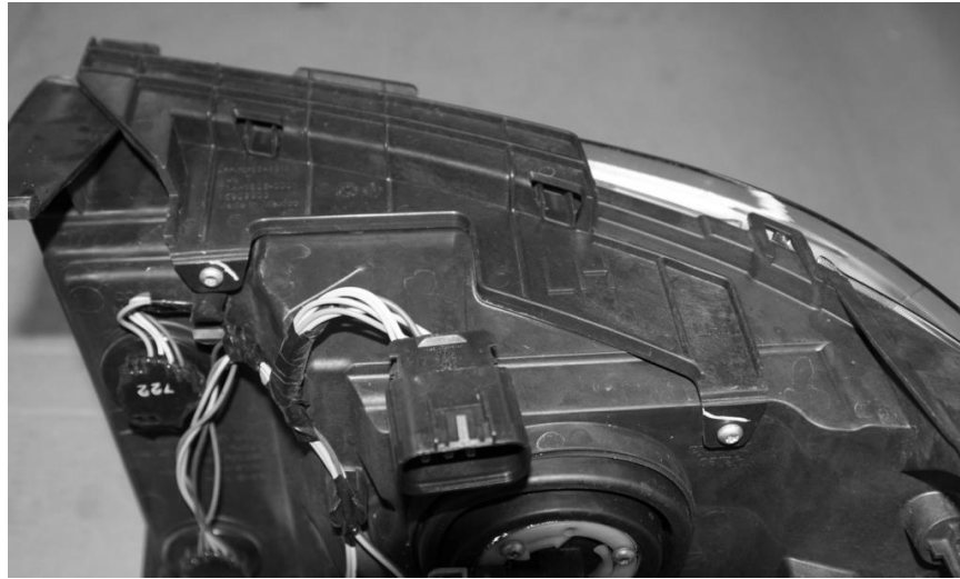
Figure 6 - TORX LOCATION