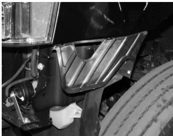
Figure 5 - SUPPORT STRUCTURE LOCATION