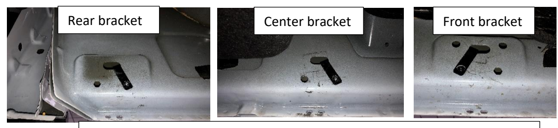
U-clip positioning. NOTE: Clips will also face forward for passenger side.