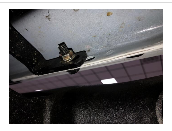
Step 7: Insert the black zinc M8 flanged bolts and flanged nuts in the pinch weld holes and leave loose for now.

Step 8: Begin tightening the lower attachment points starting with the rear bracket working your way up to the front bracket. ( 20ft/lbs )