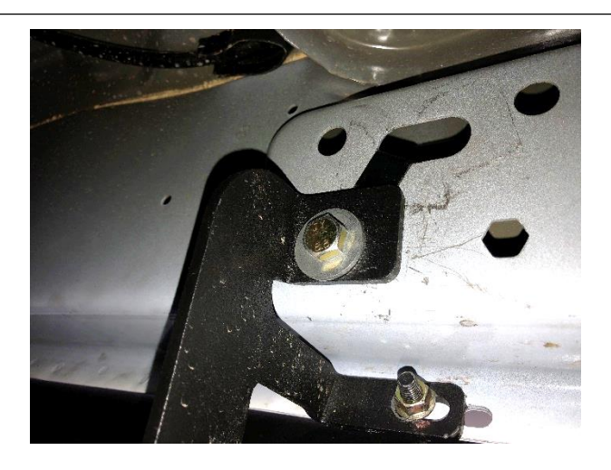
Step 10: Repeat steps 2-9 for passenger side. Your install is now

Step 9: Finish by tightening the upper attachments points from front to back. ( 20ft/lbs )