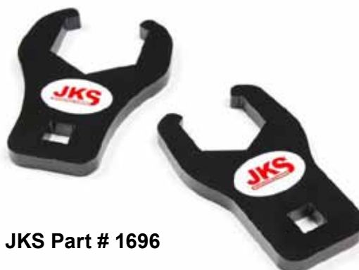
JKS Part # 1696