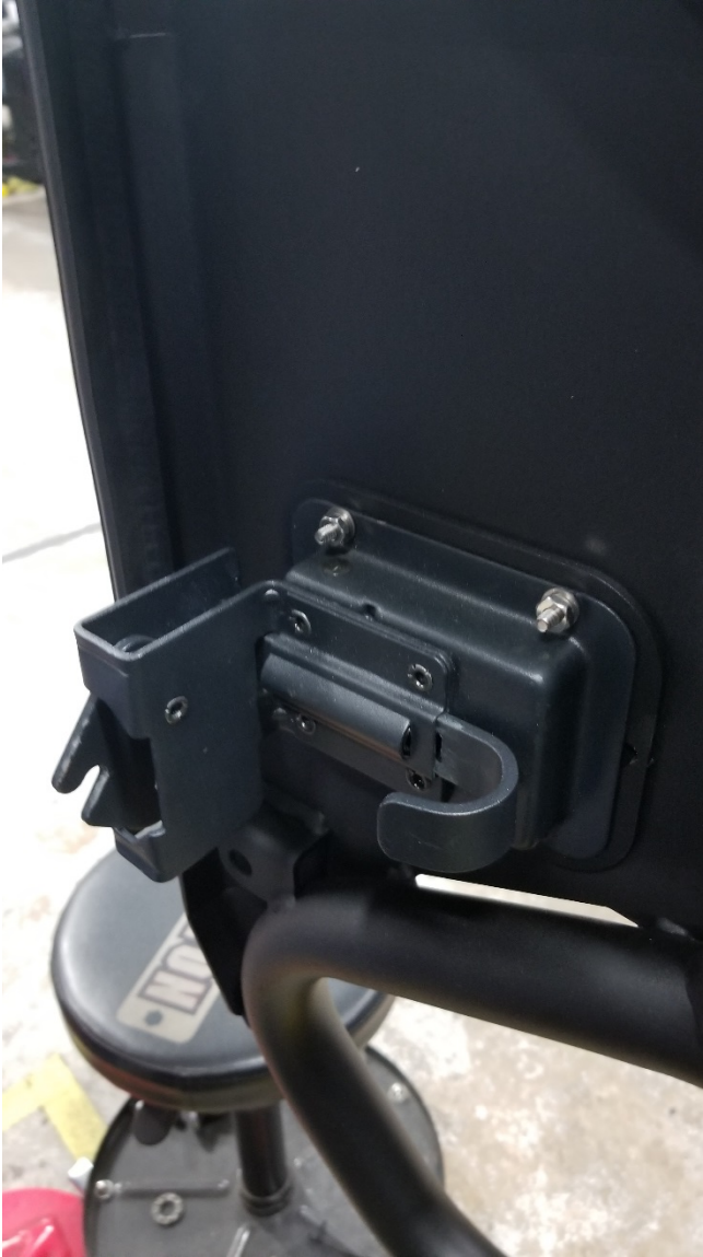
Figure1: front door latch orientation