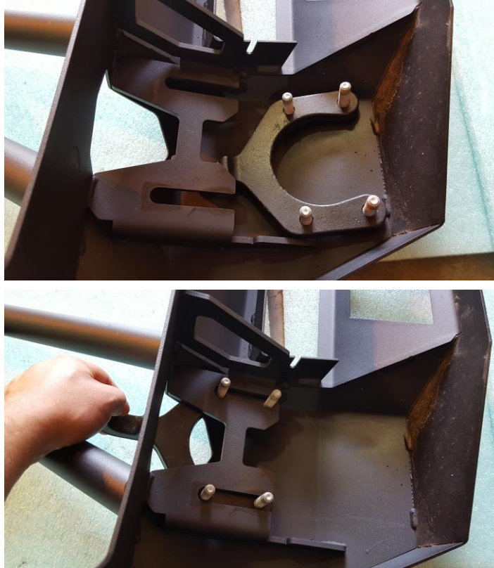
Figure 4: Installing OEM tow hooks