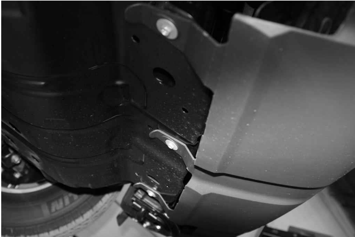
Figure 2 - Screw Locations