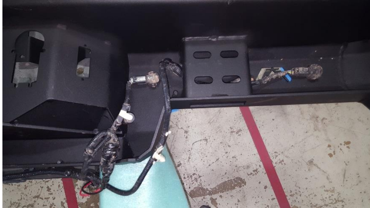
Drivers side sensor harness orientation. Passenger side is mirrored.